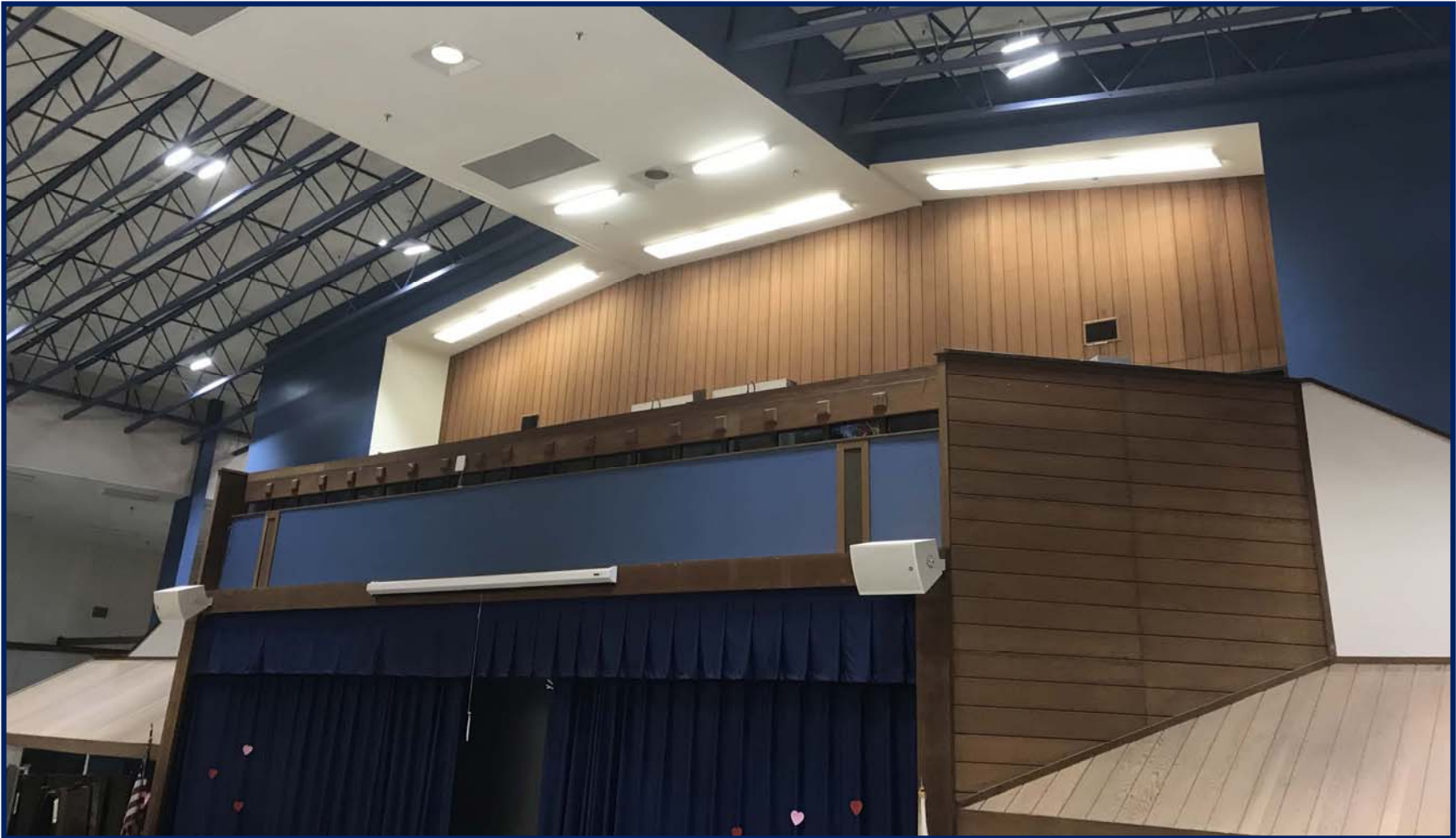
Cherrywood FIS - Before