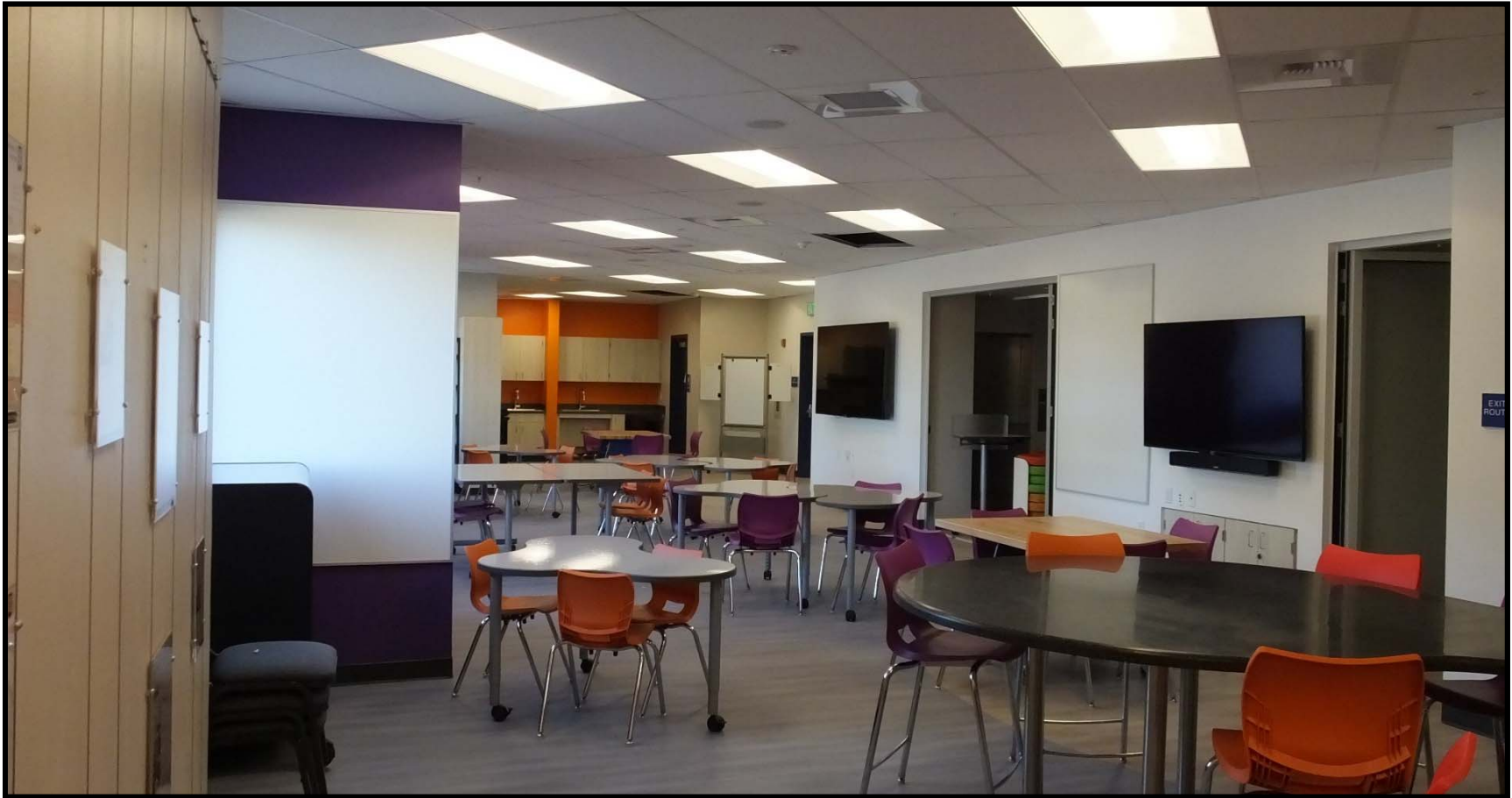
Cherrywood FIS – After