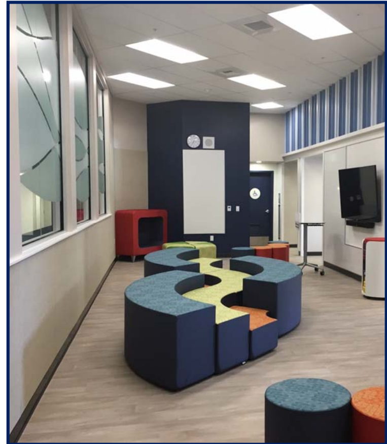
Cherrywood FIS - After