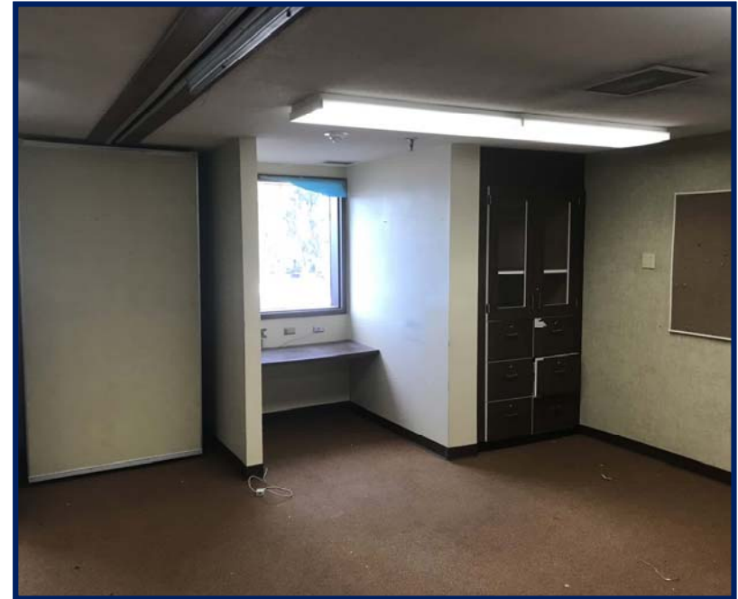
Cherrywood FIS - Before