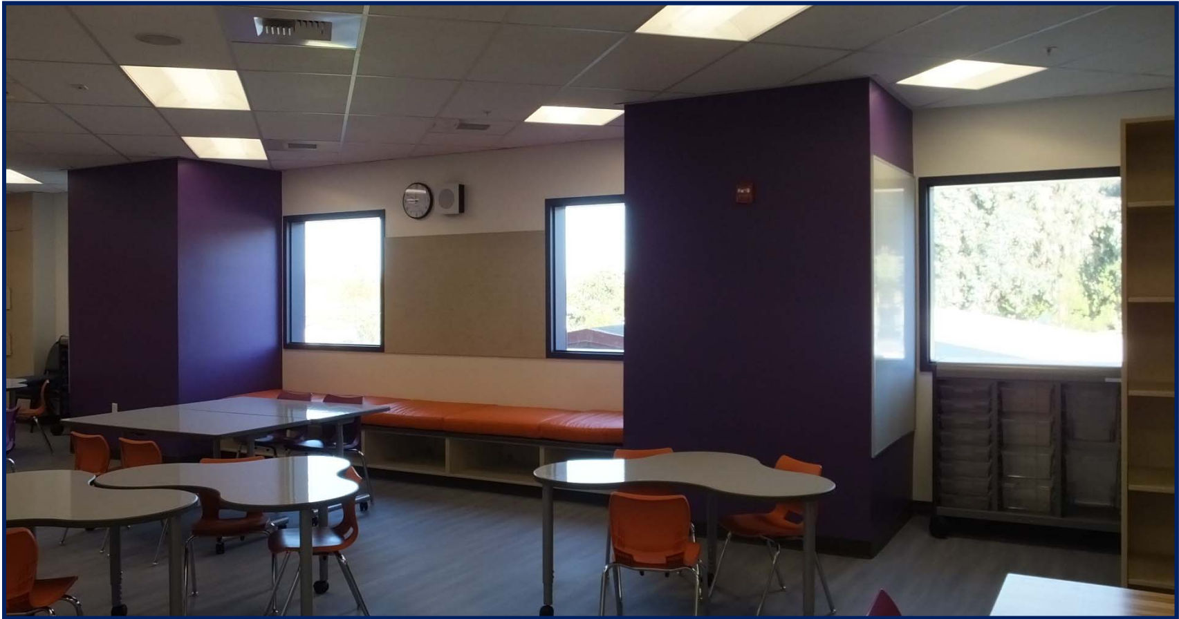
Cherrywood FIS - After