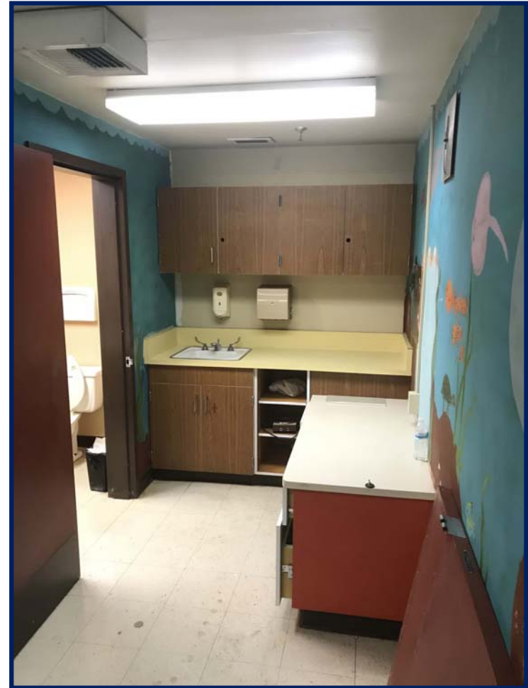
Cherrywood FIS - Before