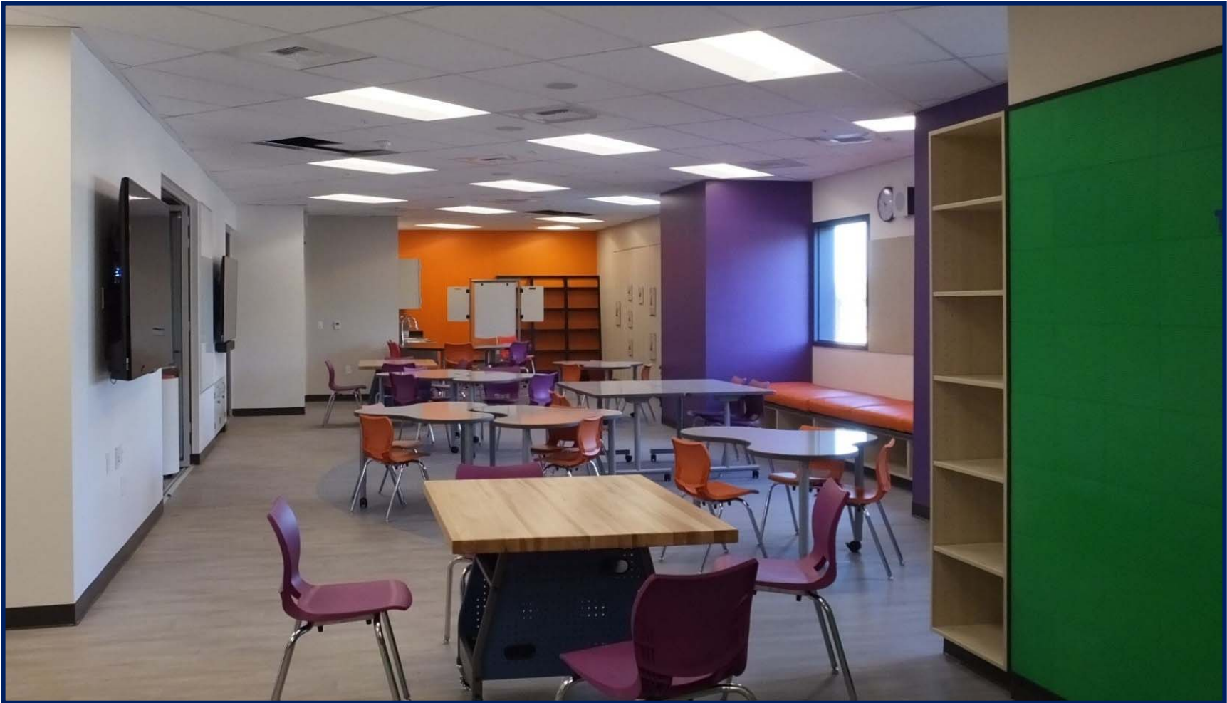
Cherrywood FIS - After