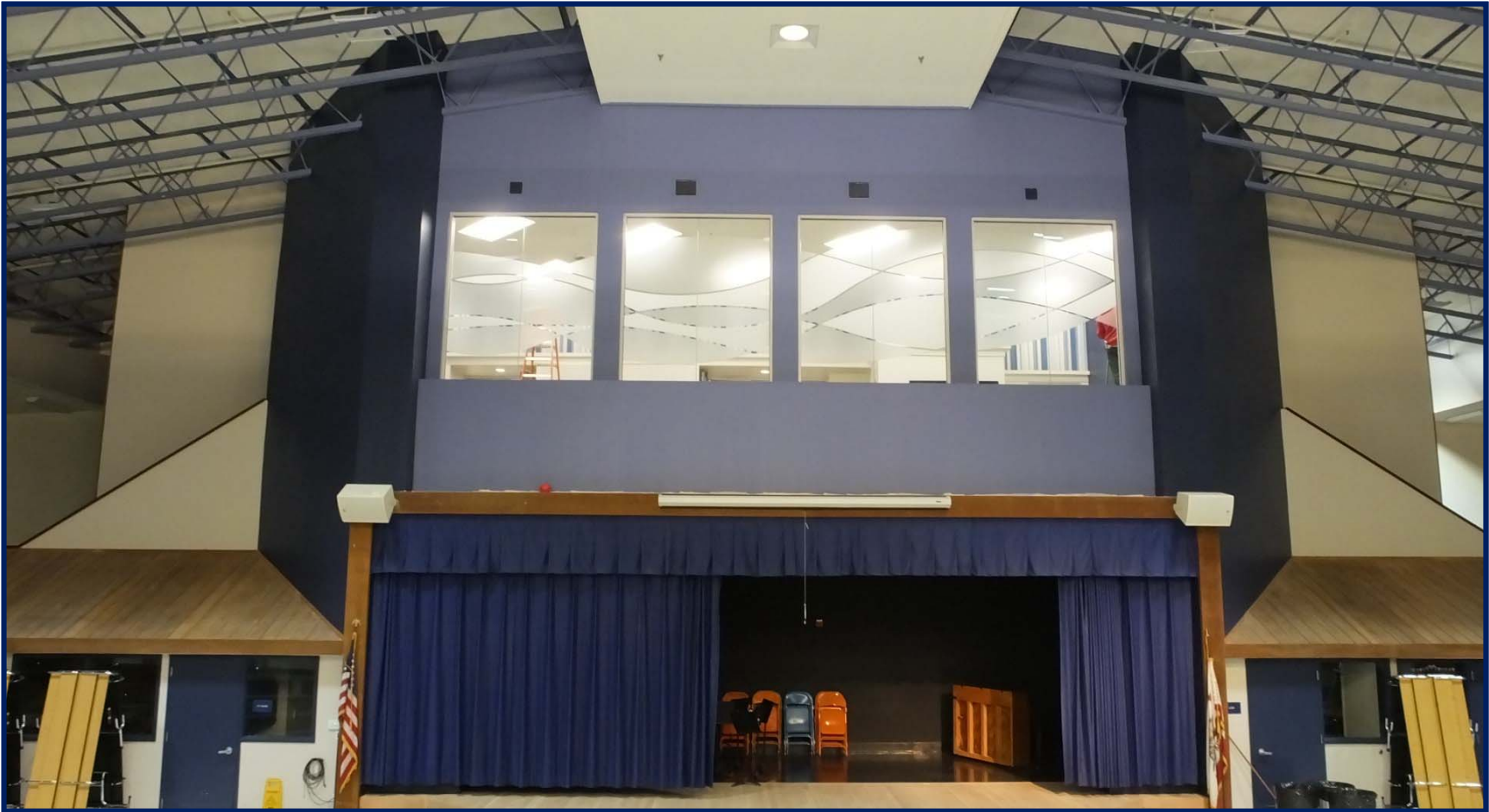
Cherrywood FIS - After